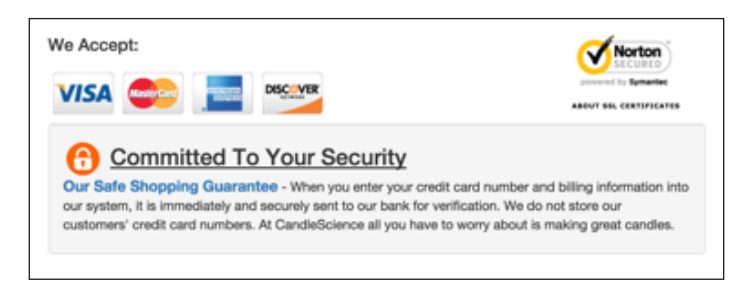
CandleScience.com provides assurance that the consumer's financial information is never stored.

Around 18 percent of shopping cart abadonment instances are due to a lack of confidence in security. Adding a security badge to the checkout page can instill trust in a shopper who might be fearful of data theft and the security of your site.