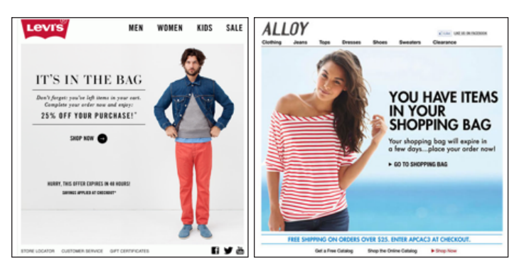
Shopping bag reminder emails are an effective way to revert the process of an abandoned shopping cart.

Often a user will abandon a shopping cart due to change of mind, or an uncertainness of wanting to purchase something at that immediate moment. Or perhaps they simply forgot there was something in their cart. To help decrease shopping cart abandonment, try sending follow-up emails that contains some sort of incentive, like free shipping or a coupon code.