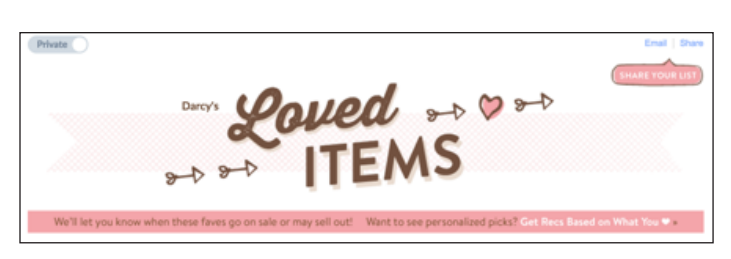
ModCloth.com engages its fans by giving them personalized product picks based on items that have been added to their wishlist.

Should the consumer be on the fence or not ready to make an immediate purchase, including "save for later" or "add to wish list" functionality in your ecommerce store is a smart idea. This will enable customers to save their wants for future purchase consideration, rather than abandoning their cart.